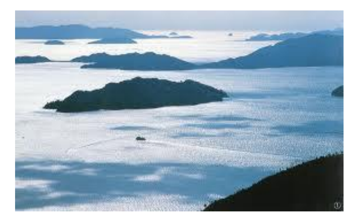
Fig 5. Seto Inland Sea in Japan Dead due to pollution, the sea was revitalised through the utilisation of Efficient Microorganisms (EM).

In 1982, Dr. Teruo Higa (1941-), a Japanese horticulture expert (Fig. 4), discovered a special, very effective combination of good microbes. He called it EM (Effective Microorganisms). It is a combination of powerful anaerobic and aerobic lactic acid bacteria, yeasts and photosynthetic bacteria, which sustain each other's activity and promote the proliferation and antioxidant activity of other bacteria as well. They particularly improve the quality of soil, increase crop yields, ensure the health of livestock and crops and maintain a clean environment (Higa 1996:31, 32). An internationally known case of their utilisation is that of the Japanese Seto Inland Sea, which was dead due to effects of industrialisation. After treatment with EM, initiated in 1997, shellfish have now been farmed there for over a decade, completely safe in terms of nutrition (Reviving 2003). At the 3<sup>rd</sup> World Water Forum held in March, 2003, which was attended by representatives from 160 countries, there was an action group dedicated exclusively to the theory and practical application of EMs (EcoPure 2003).